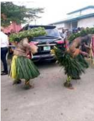
Atam dance from Ekajuk