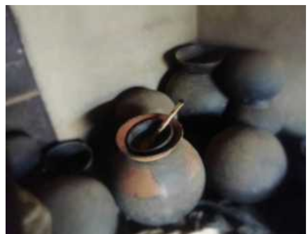
Molded clay pots in Bakor