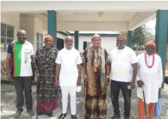
EjT Ambassadors with the Executive Chairman, Etung LGA, in the company of the Traditional Ruler's Council of Etung LGA @Efraya, Etung LGA