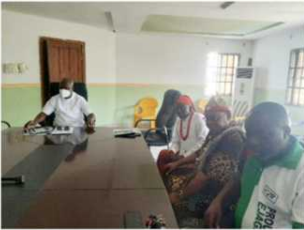
EJT Ambassadors with the Executive Chairman, Etung LGA, in the company of the Traditional Ruler's Council of