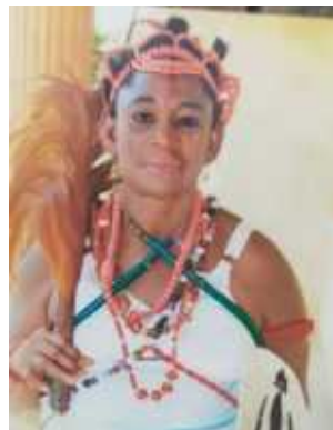
Important Occasion Dance outfit in Bakor