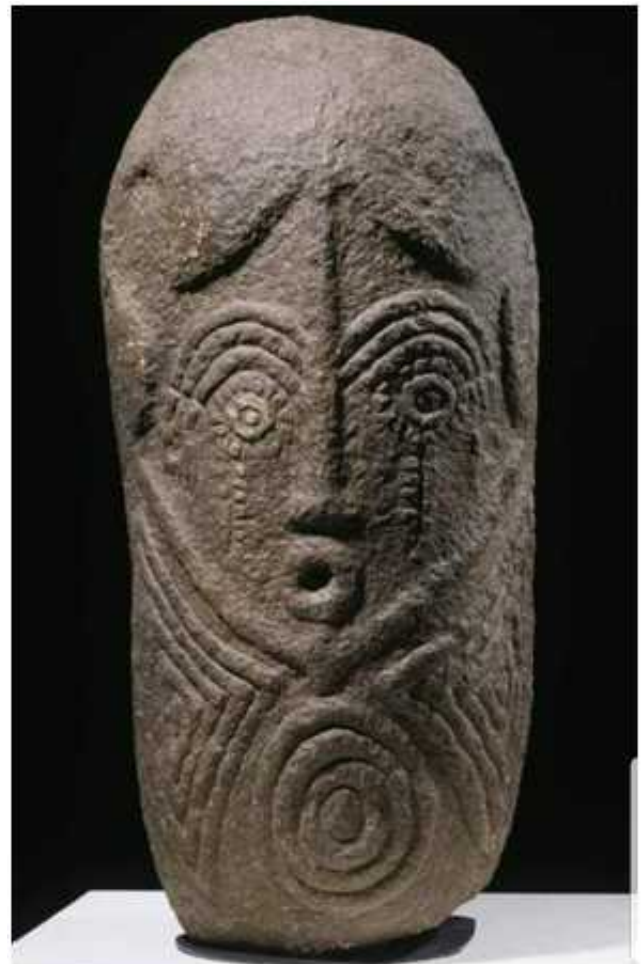
One of the ingenuities from Ejagham Bakor: They crafted Akwanshi (Akiba-nsi) Monolith dated 1200 BC

Most of the people still cling tenaciously to imperative cultures despite the European and missionary activities in the territory out to obliterate.