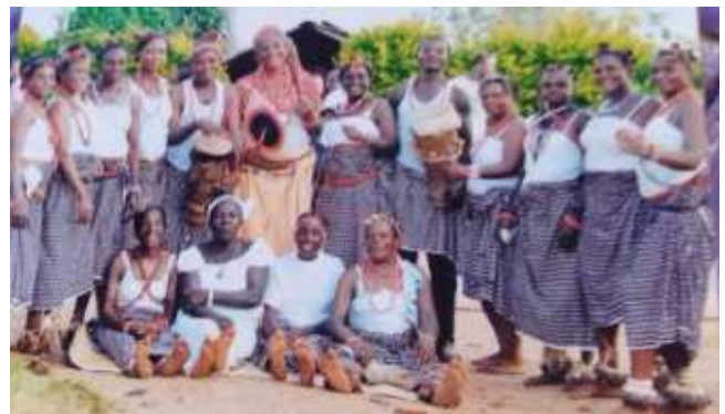
Moni-a-Nkim Dance in Bakor