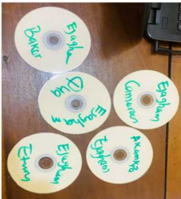
Voiceover of Ejagham dialects in CDs