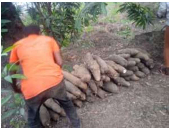
Yam harvest in Bakor