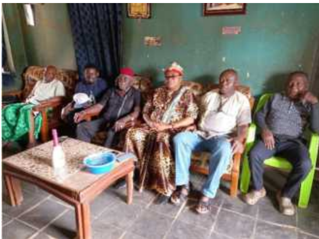
EjT Ambassadors with the Paramount Ruler-Elect of Etung LGA @Etomi Community, Etung LGA