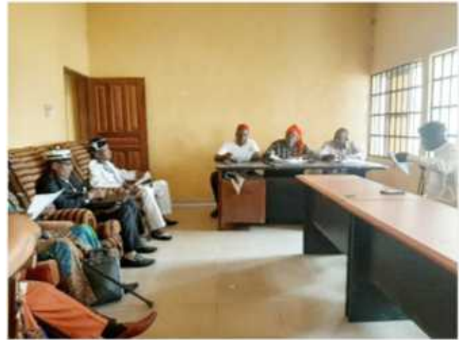
EjT Ambassadors with the Traditional Ruler's Council of Etung LGA @Effraya, Etung LGA