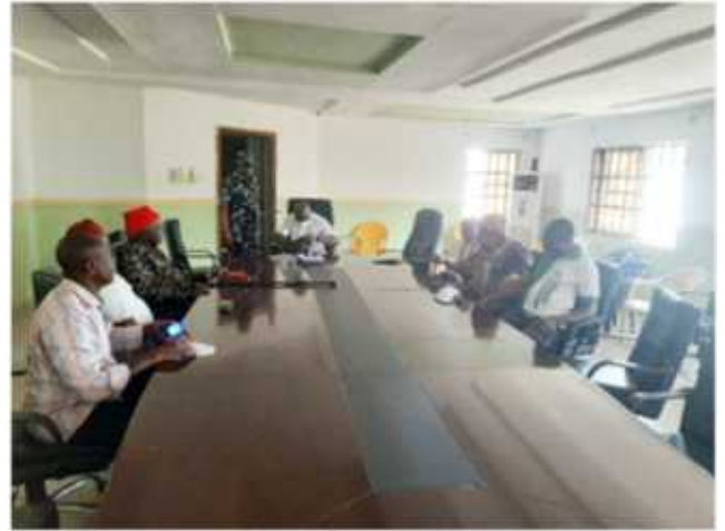
EJT Ambassadors with the Executive Chairman, Etung LGA, in the company of the Traditional Ruler's Council of Etung LGA @Efraya, Etung LGA