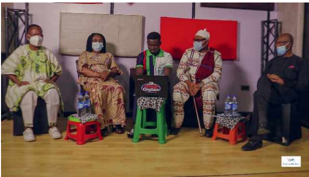
Ekubi EJT Panellists

This is a programme that deals with periodic quality conversation exchanges by people knowledgeable in aspects of Ejagham Traditional Practices (ETP) and Ejagham Cultural Expressions (ECE). The theme of the conversation was "SILO RELATIONSHIPS AND ITS IMPACTS ON EJAGHAM HERITAGE." The panelists expounded on the causes, manifestations, impacts, and elixir to the prevailing silo relationships across Ejagham Nation. By silo relationships we mean the poor inter-cluster relations in Ejagham Nation and its people.