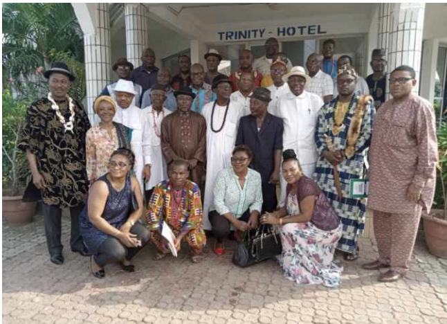
Ejagham Tradition Custodians from Ngunaya, Njemaya and Obang clusters at the Launch of Ejagham Language Codification Project

is worthy of emulation by other Ejagham communities. Ekup na nkad to Ejagham Cameroon.