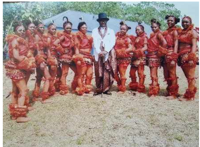
Abon-okim from Oban, Akamkpa Ejagham

Motivational Deficit: Our mission requires significant motivation among Ejagham people to intellectualise Ejagham Traditional Practices (ETP) and Ejagham Cultural Expressions (ECE). The sure and sustainable approach is to give our ETP and ECE Triple-D treatment i.e. Document, Digitalise & Disseminate them. Can we individually and collectively change this deficit into a surplus, yes we can, if you play your role.