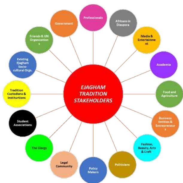
Fig. 1.: EJT Stakeholders Galaxy