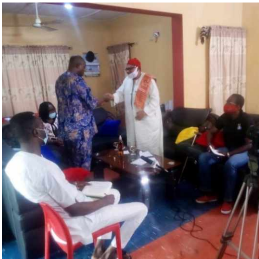
Joint Session of ELCC and EJB