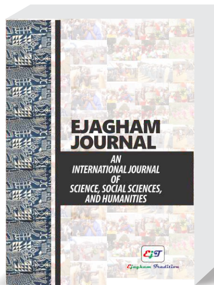
Outline of Ejagham Journal

general public. So far publicity of the Call for Papers has been on social media and generally internet based, as this is cost effective. Work is in progress to engage with print, TV and Radio media but these are cost intensive. Your financial support and sponsorship would be appreciated.