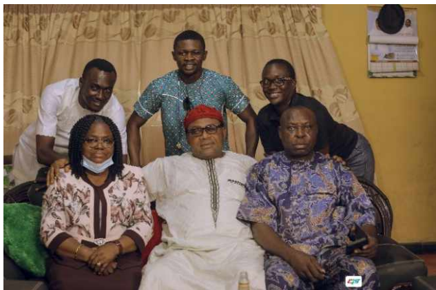
Joint ELCC & EJB Meeting in Calabar

If you know anything about Ejagham heritage, don't just think or talk about it, write about it and send it to EJB, be a "Proudly Ejagham" author.